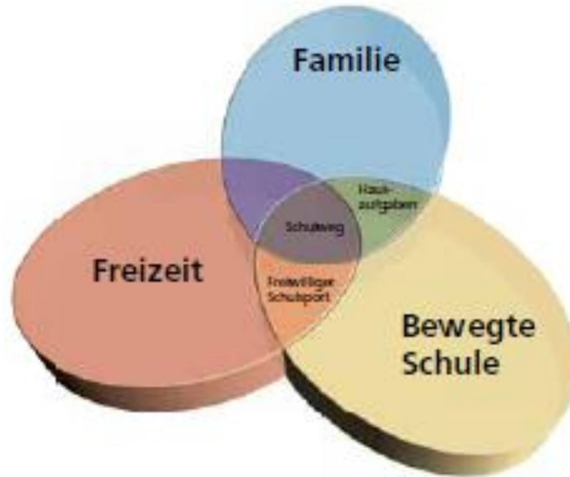
Modell: Die Bewegte Schule in der Lebenswelt der Kinder und Jugendlichen