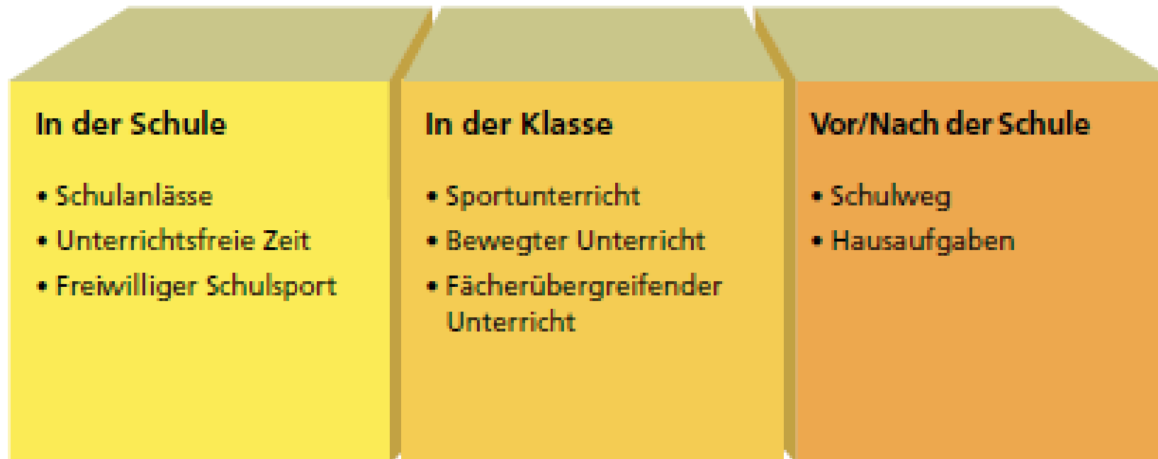
Modell: Bewegte Schule